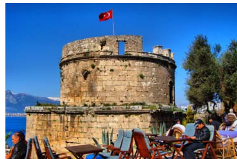
Antalya's Hidirlik Tower