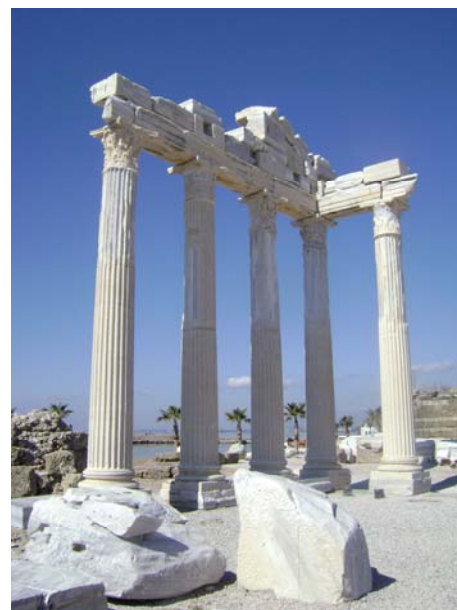
The Temple Of Apollo, Side

Antalya Archaeological Museum, Perge & Side: The winner of a pan European award, Antalya's museum displays its magnificent collection of antiquities to great effect and sets the scene beautifully for the following guided tour of Perge, one of the great Mediterranean cities of antiquity. To conclude the day, time at leisure is allowed for you to explore the fascinating ancient port city of Side.