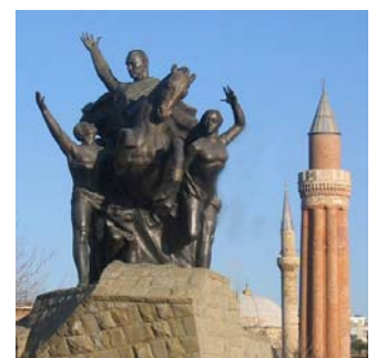
The Ataturk Monument