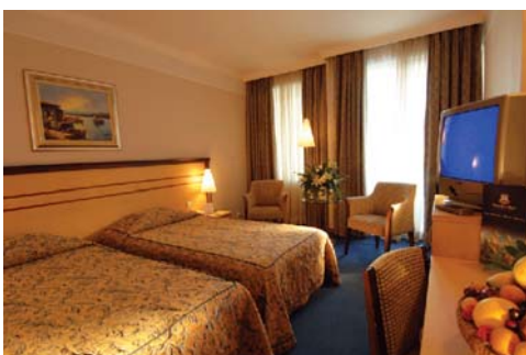
A Standard Twin Room