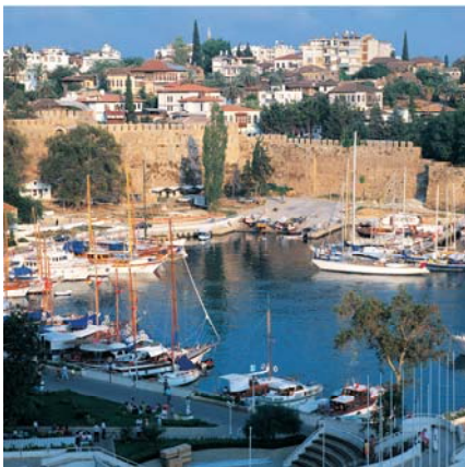
Antalya's Ancient Harbour

Antalya is regarded by many as Turkey's most beautiful city, benefitting from a benign climate, a scenic Taurus Mountains backdrop, a stunning ancient fortified port, an endearingly picturesque old town, acres of clifftop parkland, and some thoughtful and conscientiously executed town planning. Over 2,000 years of history are represented there, and in addition to a number of interesting and contrasting historic monuments, the city also houses one of the finest archaeological museums in the Mediterranean. Its hinterland largely comprises the ancient prosperous Roman ruled region of Pamphylia, featuring a number of remarkable archaeological sites, most notably the ancient cities of Perge, Aspendos and Side. Turkish classified as a 5-star hotel, the elegant Hotel Porto Bello enjoys wonderful views of both the Mediterranean and the dramatic Taurus Mountains. It also offers a very high quality all inclusive arrangement featuring wonderful Turkish and international cuisine and a wide selection of beverages.